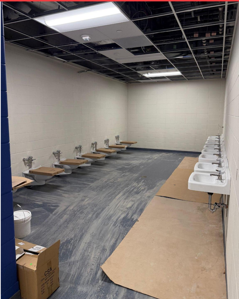
2 nd Floor Level Restroom