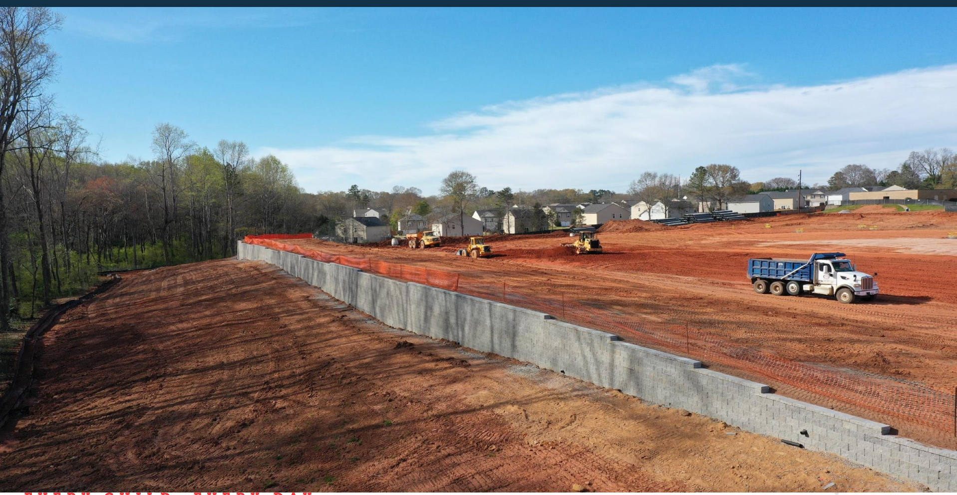
EVERY CHILD, EVERY DAY.