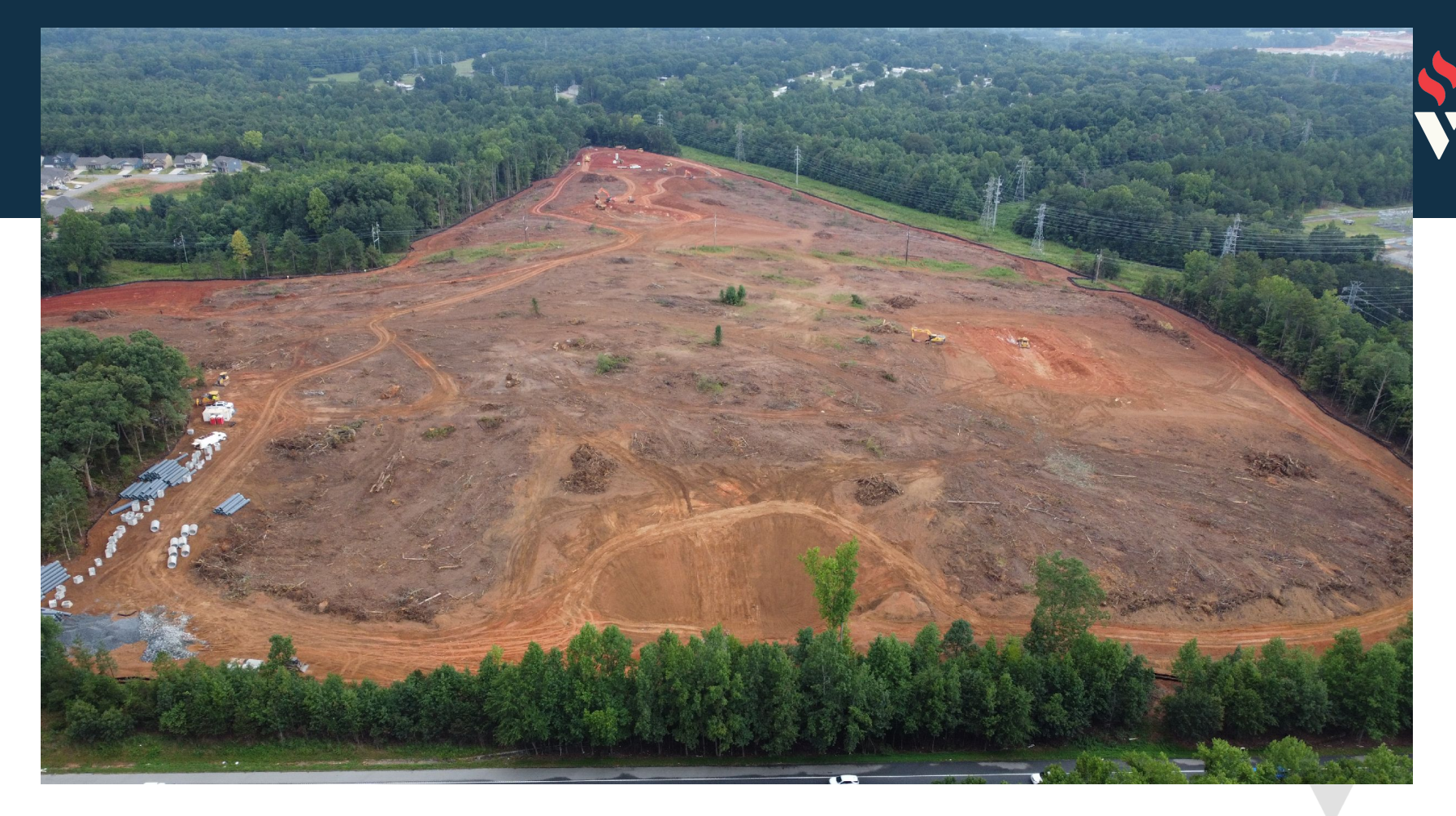
EVERY CHILD, EVERY DAY.