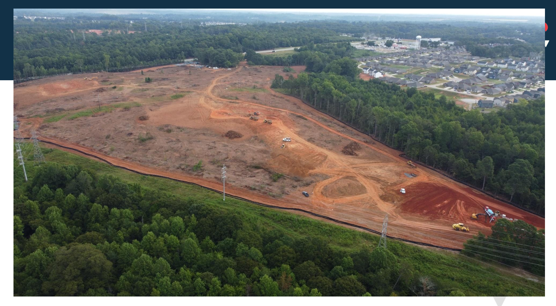
EVERY CHILD, EVERY DAY.