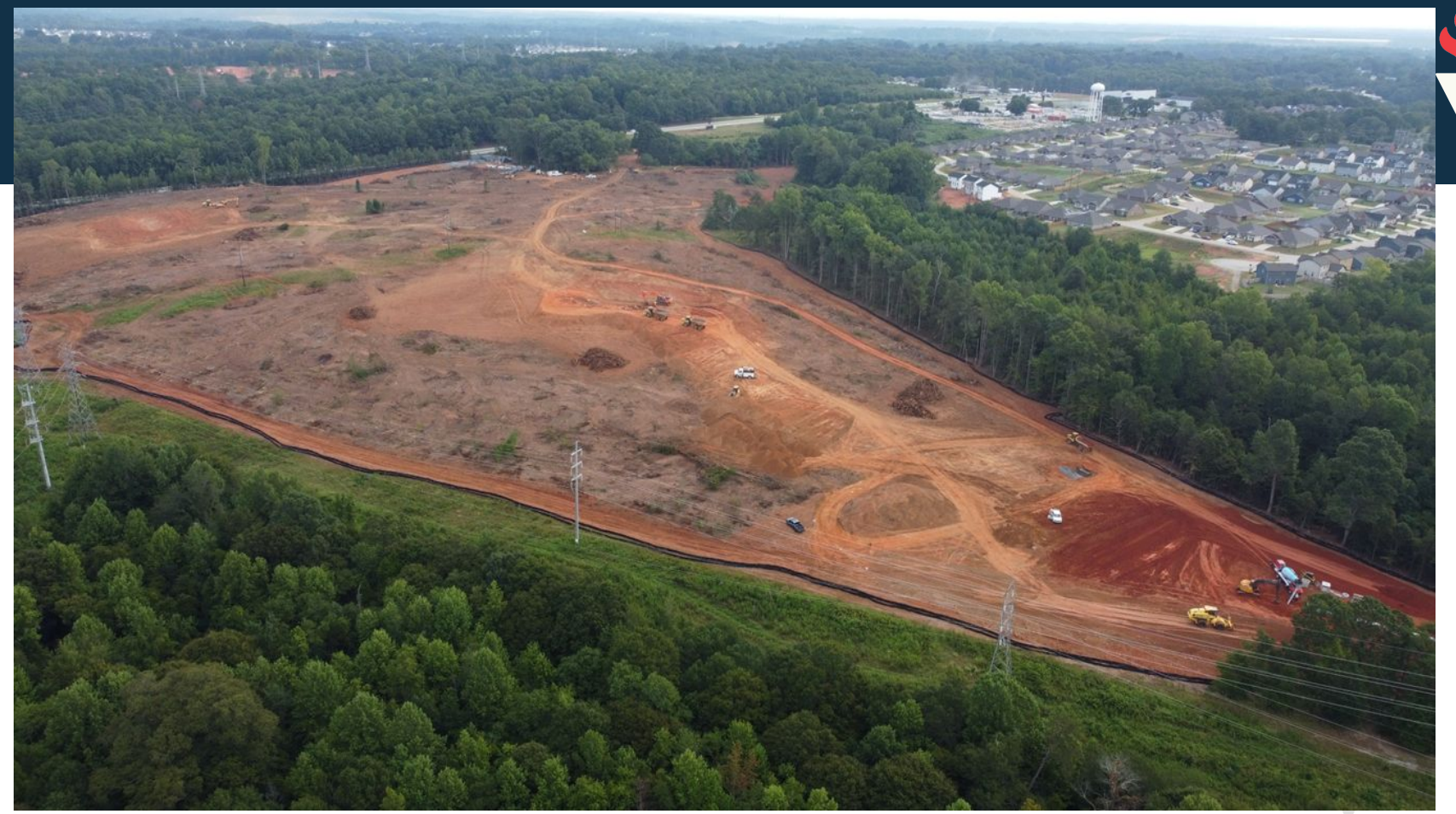
EVERY CHILD, EVERY DAY.