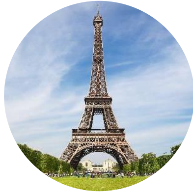
Take a guided tour of Paris