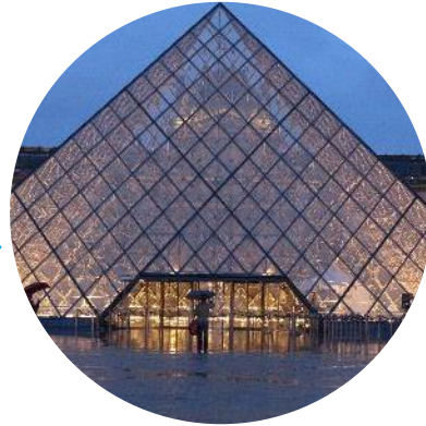
Visit the Louvre