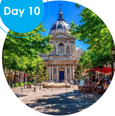
Explore the Latin Quarter