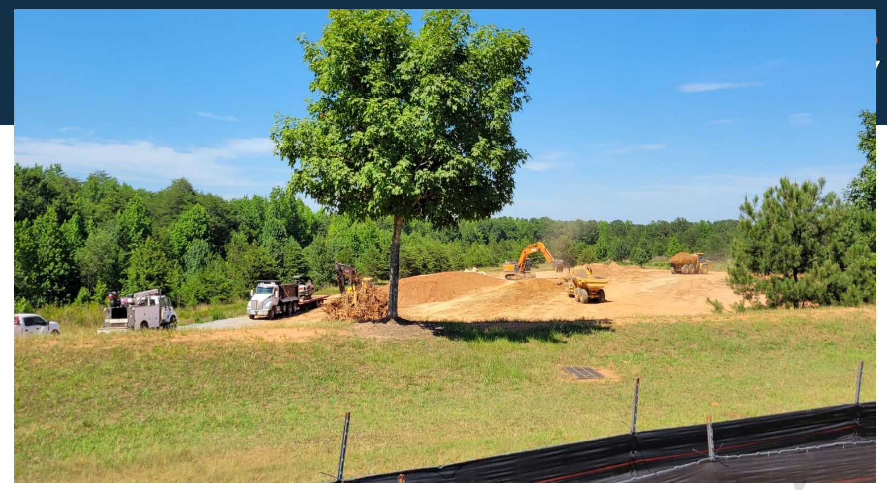
EVERY CHILD, EVERY DAY.