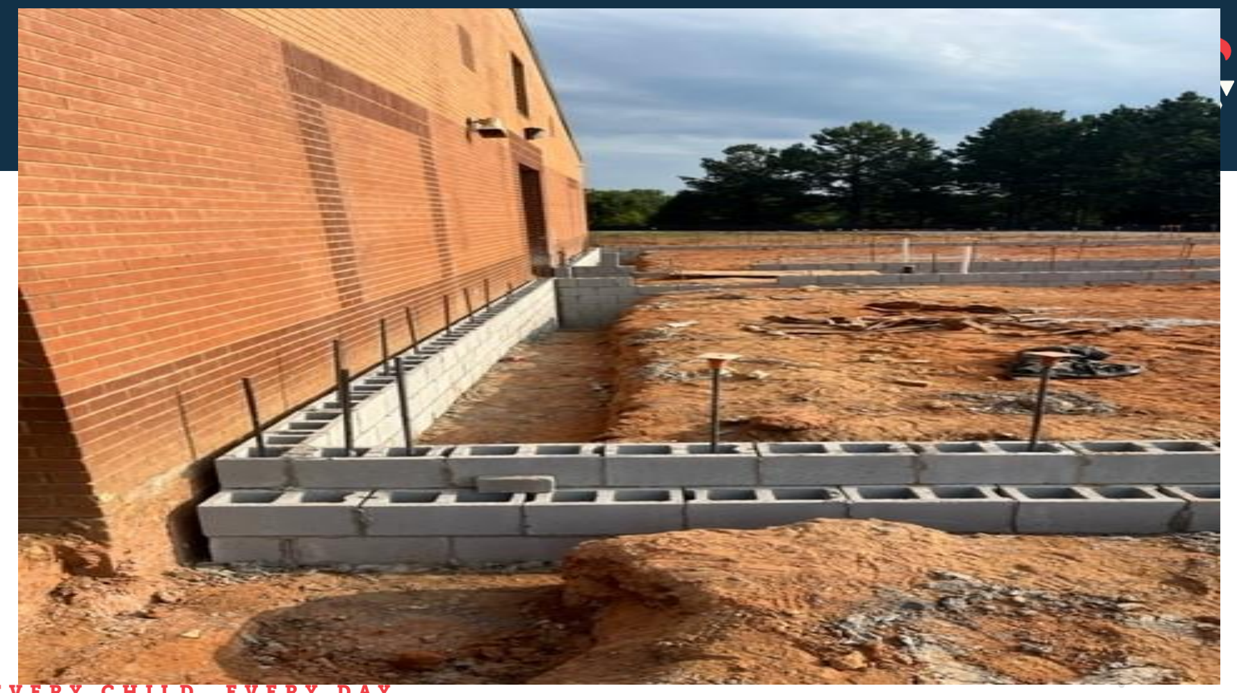
EVERY CHILD, EVERY DAY.