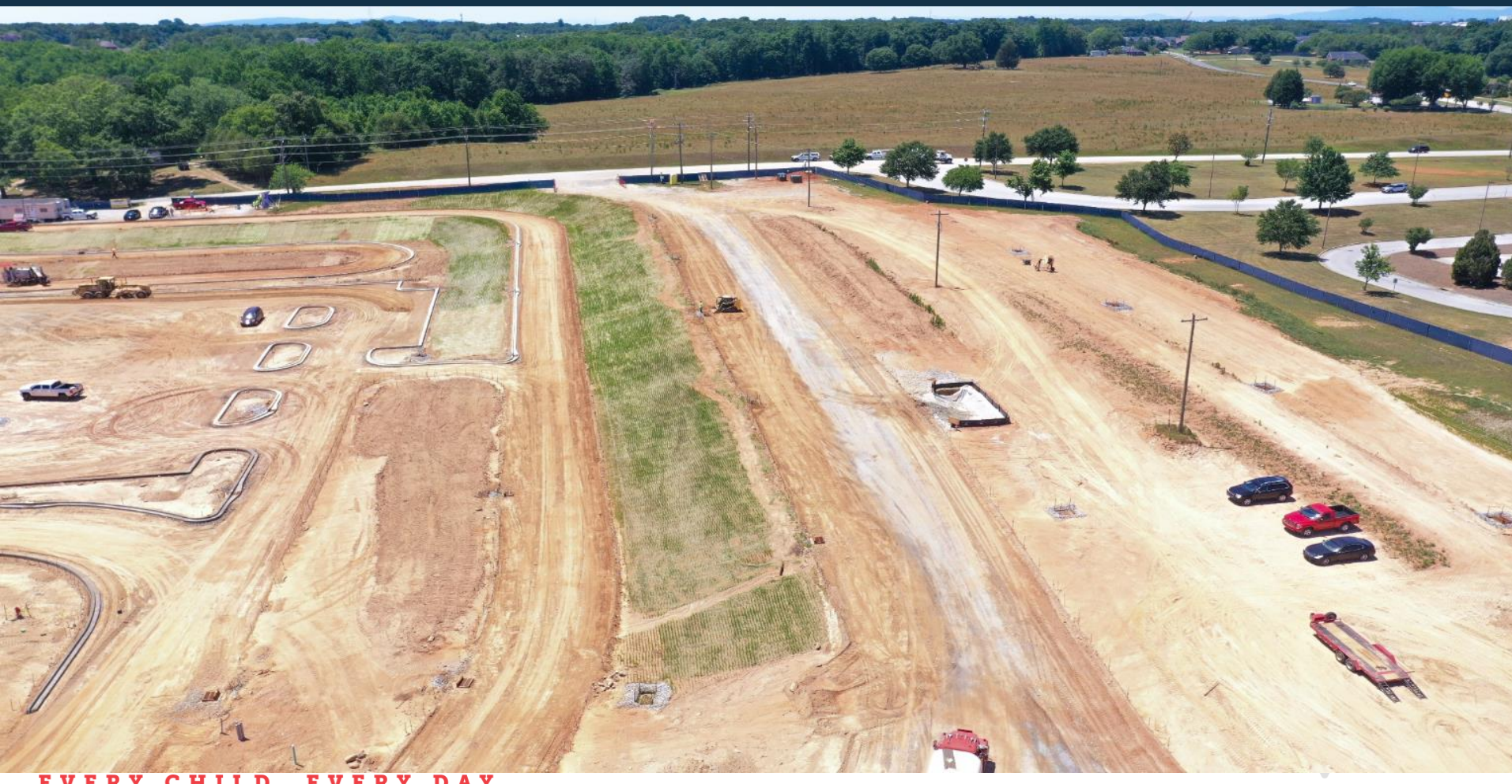
EVERY CHILD, EVERY