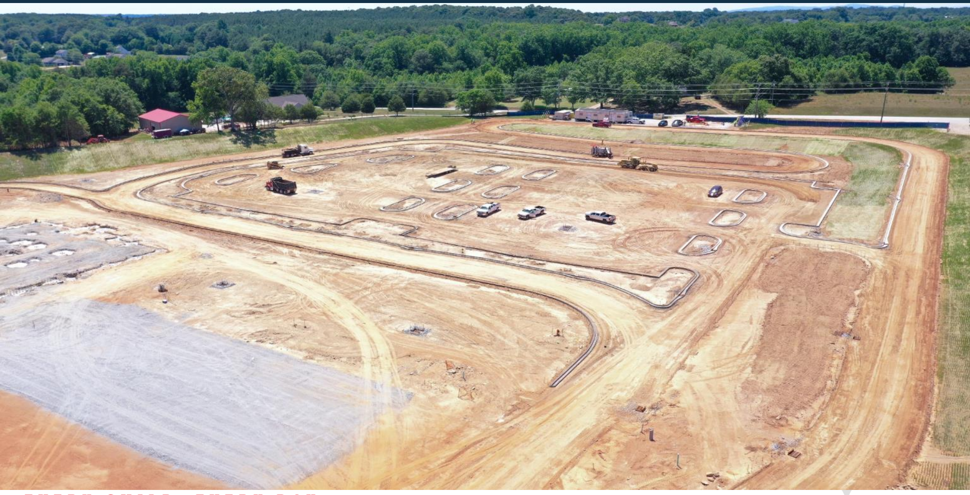
EVERY CHILD, EVERY DAY.