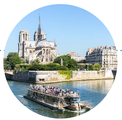
Enjoy a Seine River cruise