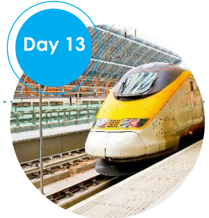
Take the Eurostar across the channel to London