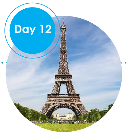
Take a guided tour of Paris